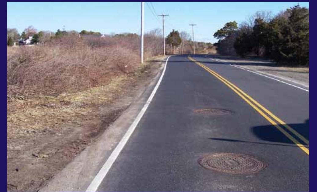
Final pavement with new asphalt