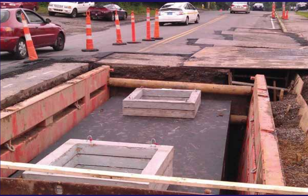
Installation of manholes