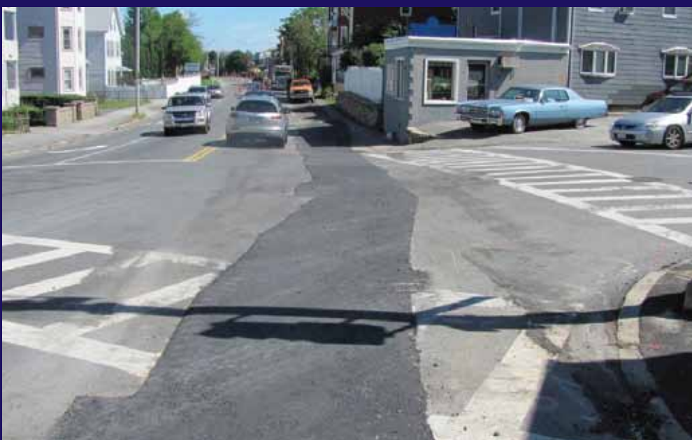
Backfill trench and install temporary pavement