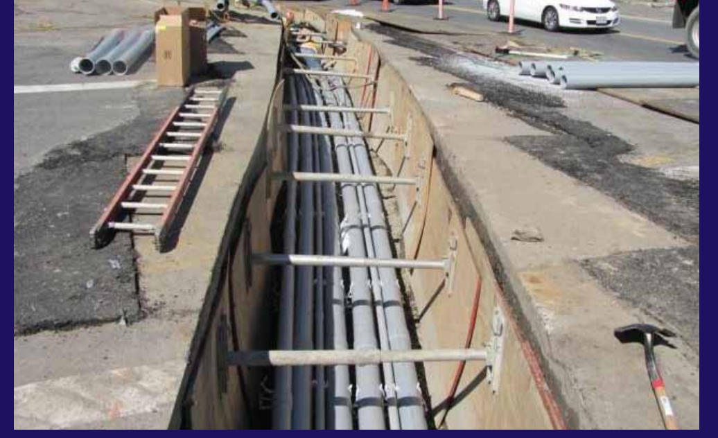
Lay conduit and encase in concrete