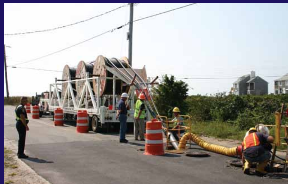
Pull and splice cable