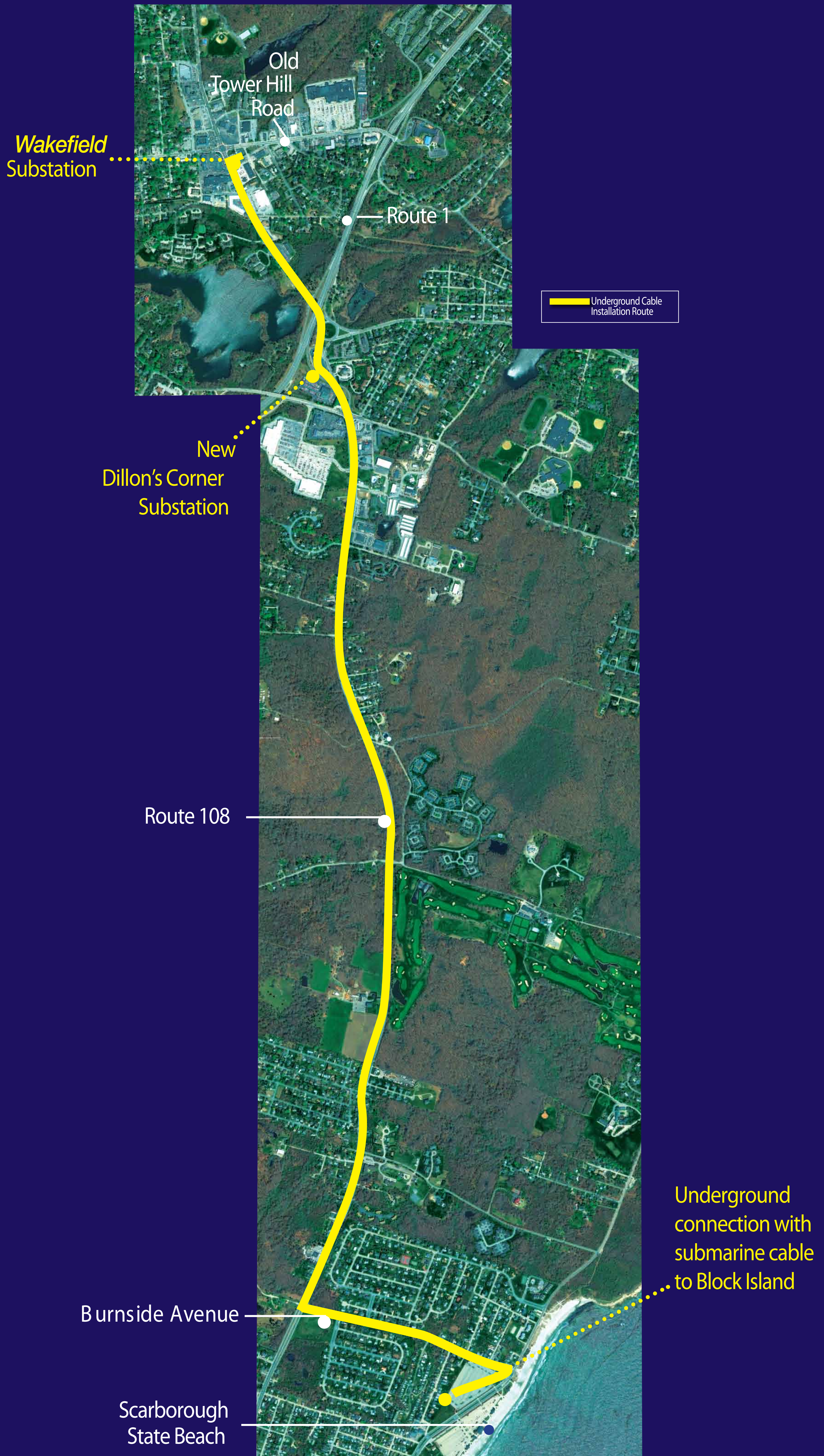
This map is for illustrative purposes only and does not represent exact details.